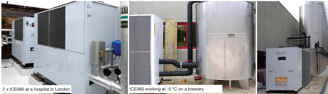
2 x ICE090 at a hospital in London

To obtain the required cooling capacity multiply the value at nominal conditions by the above correction factors (i.e. cooling capacity = P \times f1 \times f2 \times f3 \times f4 , where P is the cooling capacity at conditions (1)). Hyperchill, in its standard configuration, can operate up to ambient temperatures of max 45 °C. The above correction factors are approximative: for a precise selection always refer to the software selection program.