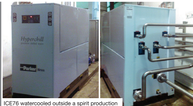
ICE76 watercooled outside a spirit production