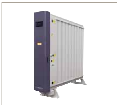
MAXIGAS PSA nitrogen gas generators

Please consult with your local Parker representative to ensure selection of the correct solution tailored exactly to your requirements.