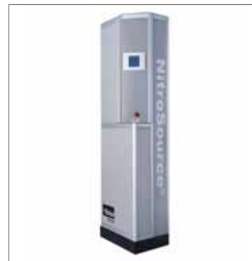
NitroSource HiFluxx membrane nitrogen gas generators

Ancillary products available to complete a total food grade nitrogen solution: