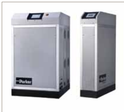
NitroFlow membrane nitrogen gas generators