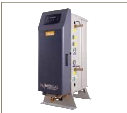
MIDIGAS PSA nitrogen gas generators