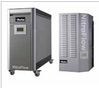
NitroFlow basic membrane nitrogen gas generators

Please consult with your local Parker representative to ensure selection of the correct solution tailored exactly to your requirements.